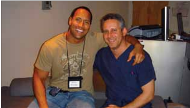
The Rock, aka Dwayne Johnson, after his LASIK surgery.