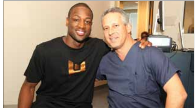
Millennium Eye has a partnership with the Miami Heat.

Dwyane Wade provided a testimonial on the practice's website ( www.mleye.com/testimonial.asp?testimonialid=8 ).