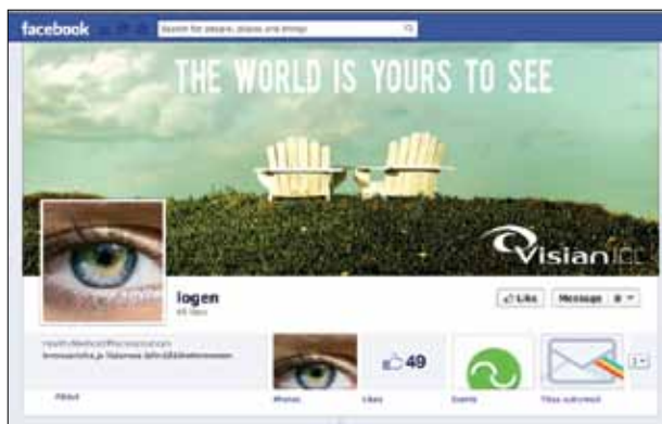
Facebook page for Iogen (facebook.com/iogen).